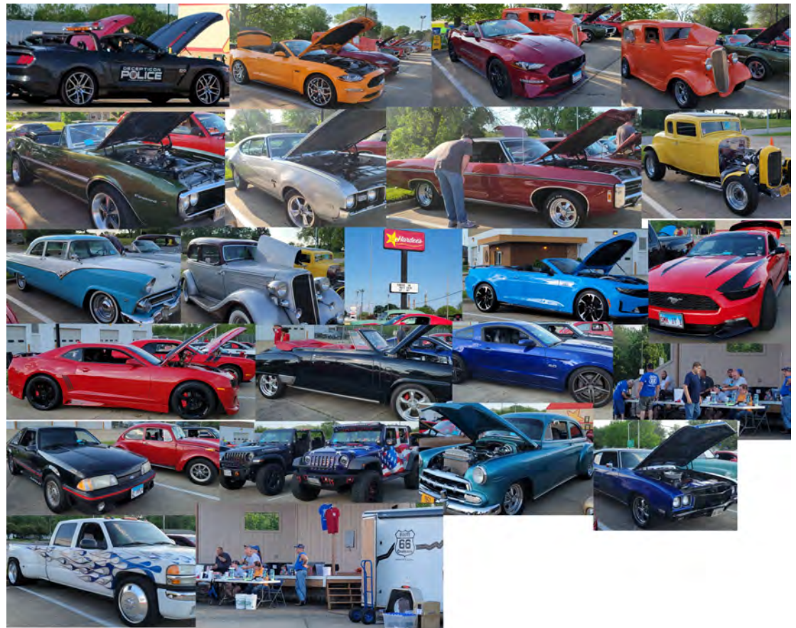
Sponsor's Choice Award